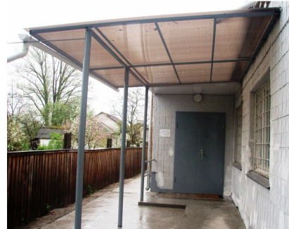
New ramp and covering now in place.

The refurbishment of the centre is now completed.