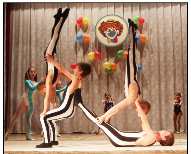
Our children performing in Circus School Concert

Of course, the Genesis house kids enjoy a healthy diet with lots of home-grown produce resulting in much excess energy! Our foster parents have found the perfect release for it – Circus School: