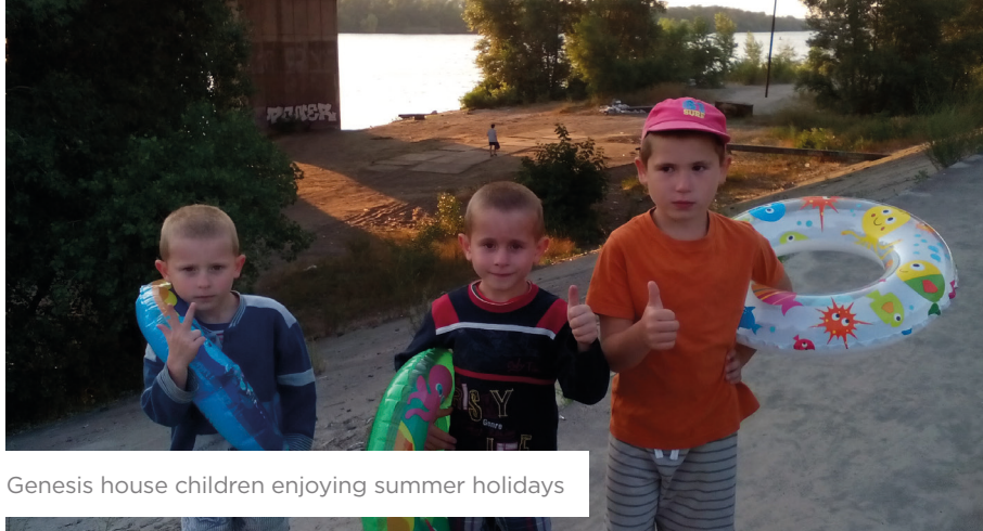
Genesis house children enjoying summer holidays

Apart from supplying some extra mattresses for Genesis Hostel and our annual bursary contributions for education for the poorest families, we have no further project pending at the moment. We have to be cautious with funds due to the poor performance of the £ and inflation in Ukraine; we must carefully protect our resources needed to support Genesis House as our children are still young.